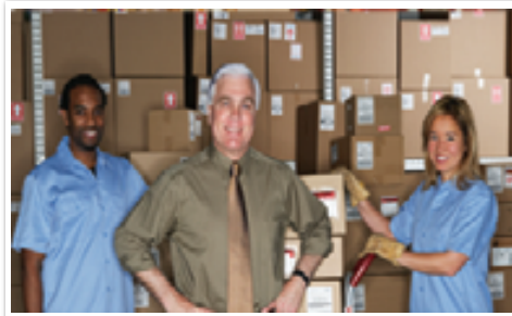
• Inventory management