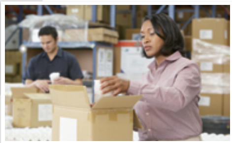
• Customs Clearance Inspection