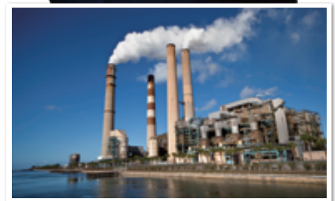
• Facility Safety Inspection